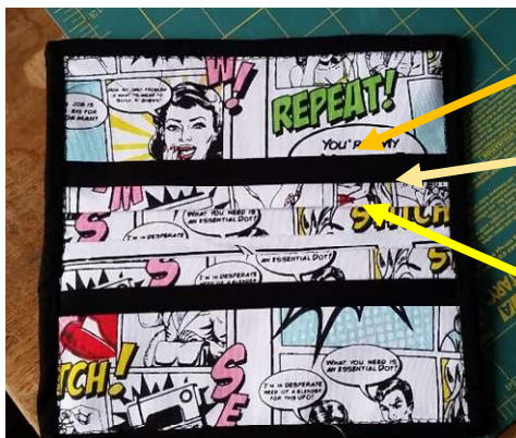
Inside of wallet